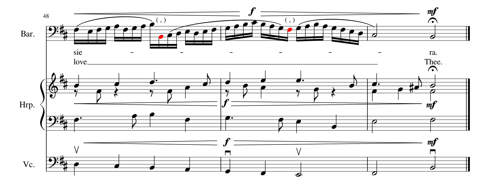
Copyright 2017 Arthur Eschenlauer, All Rights Reserved - Permission is granted to copy this work freely, subject to the license's terms. Licensed under the Creative Commons Attribution-ShareAlike 4.0 International License, http://creativecommons.org/licenses/by-sa/4.0/.