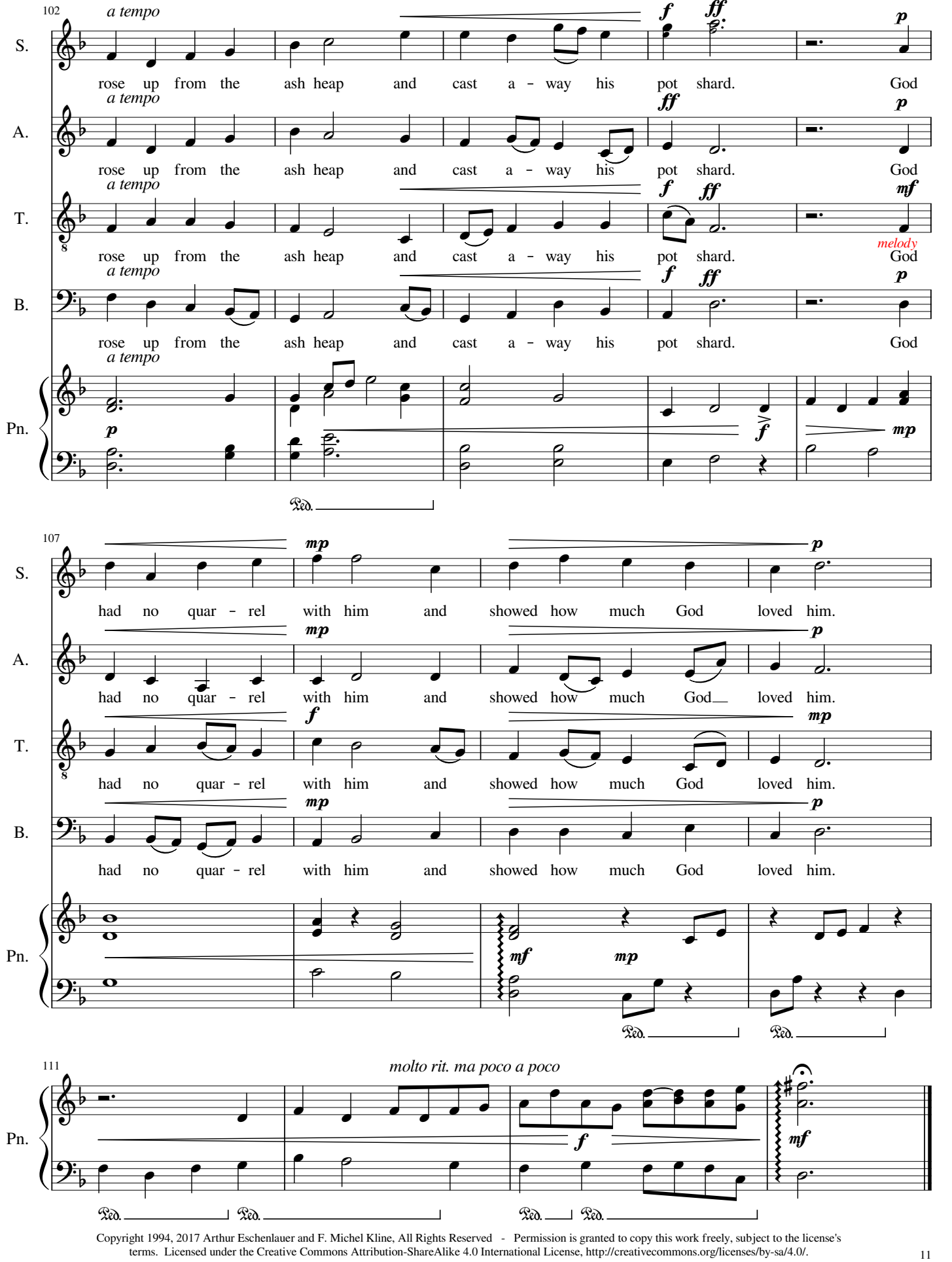
terms. Licensed under the Creative Commons Attribution-ShareAlike 4.0 International License, http://creativecommons.org/licenses/by-sa/4.0/.